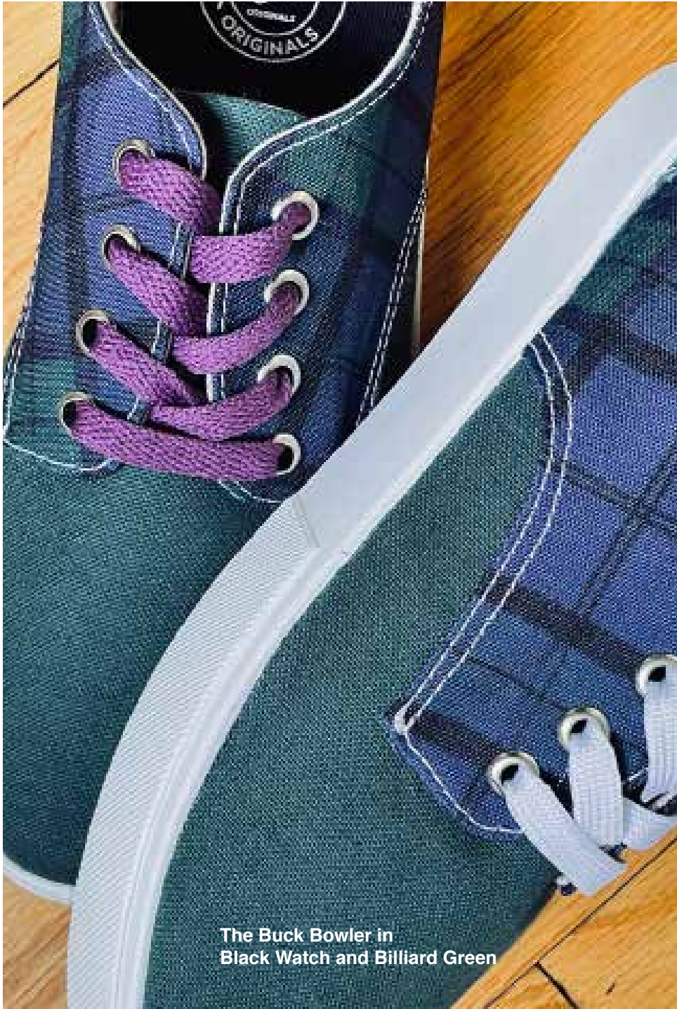
The Buck Bowler in Black Watch and Billiard Green