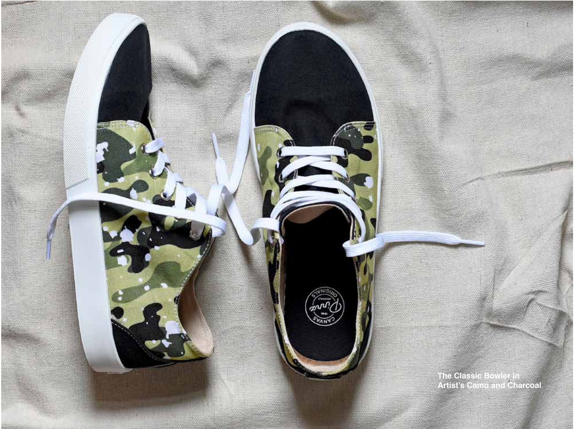
The Classic Bowler in Artist's Camo and Charcoal