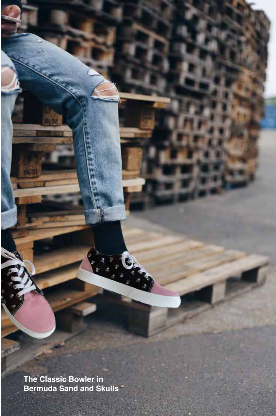
The Classic Bowler in Bermuda Sand and Skulls