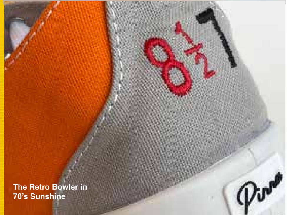
The Retro Bowler in 70's Sunshine