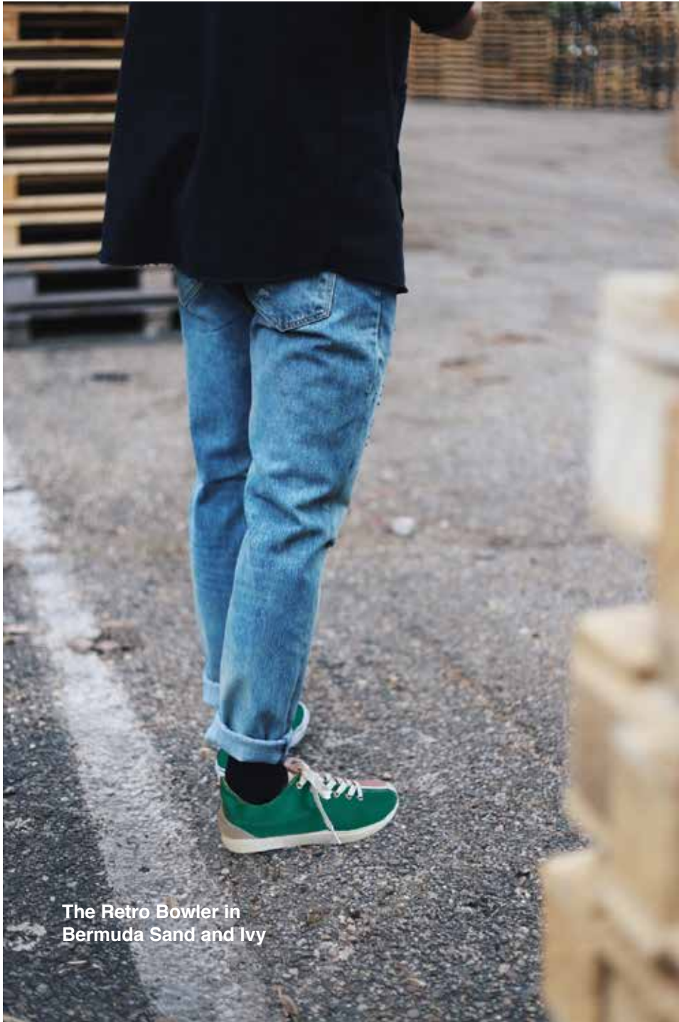
The Retro Bowler in Bermuda Sand and Ivy