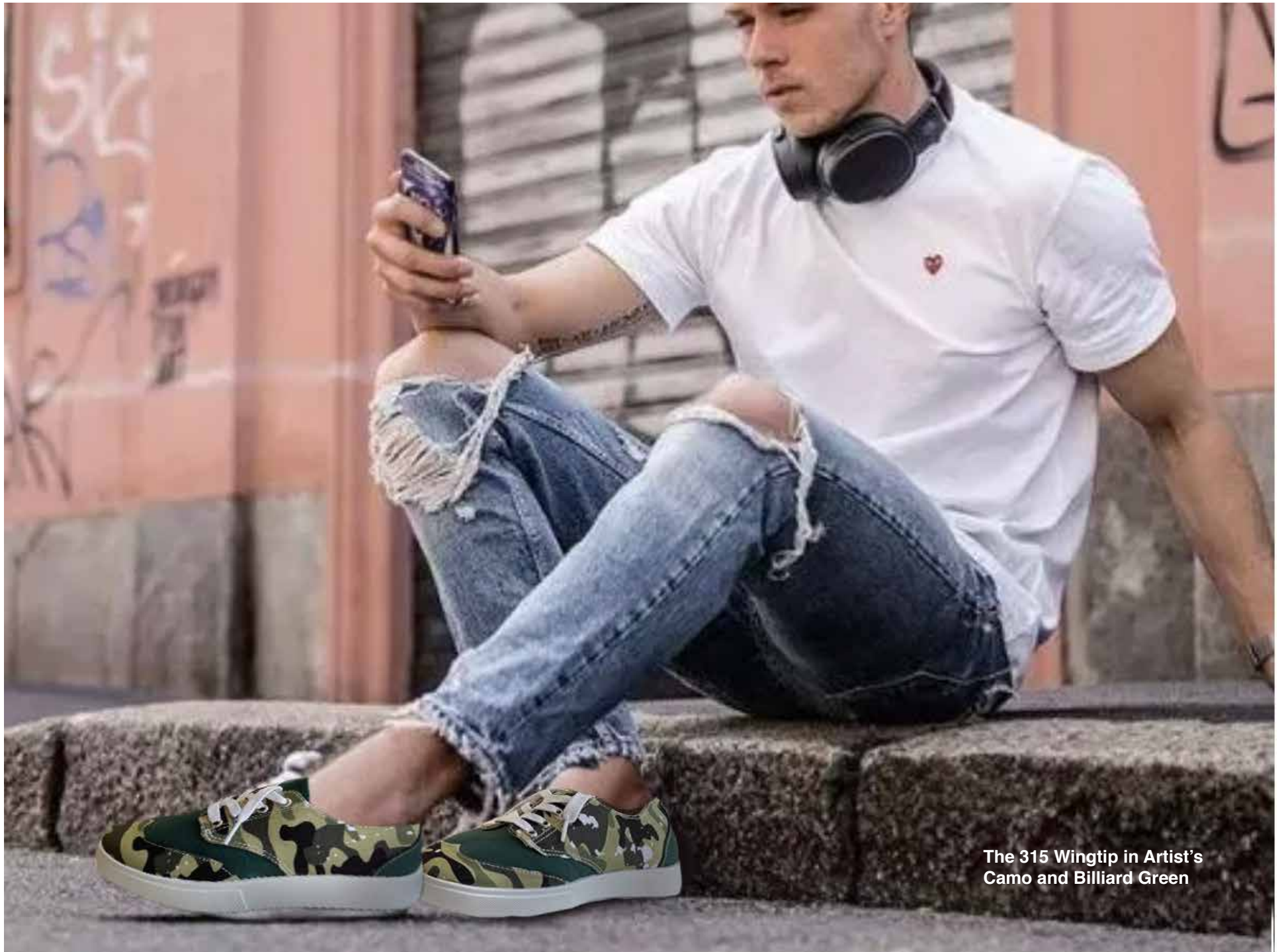
The 315 Wingtip in Artist's Camo and Billiard Green