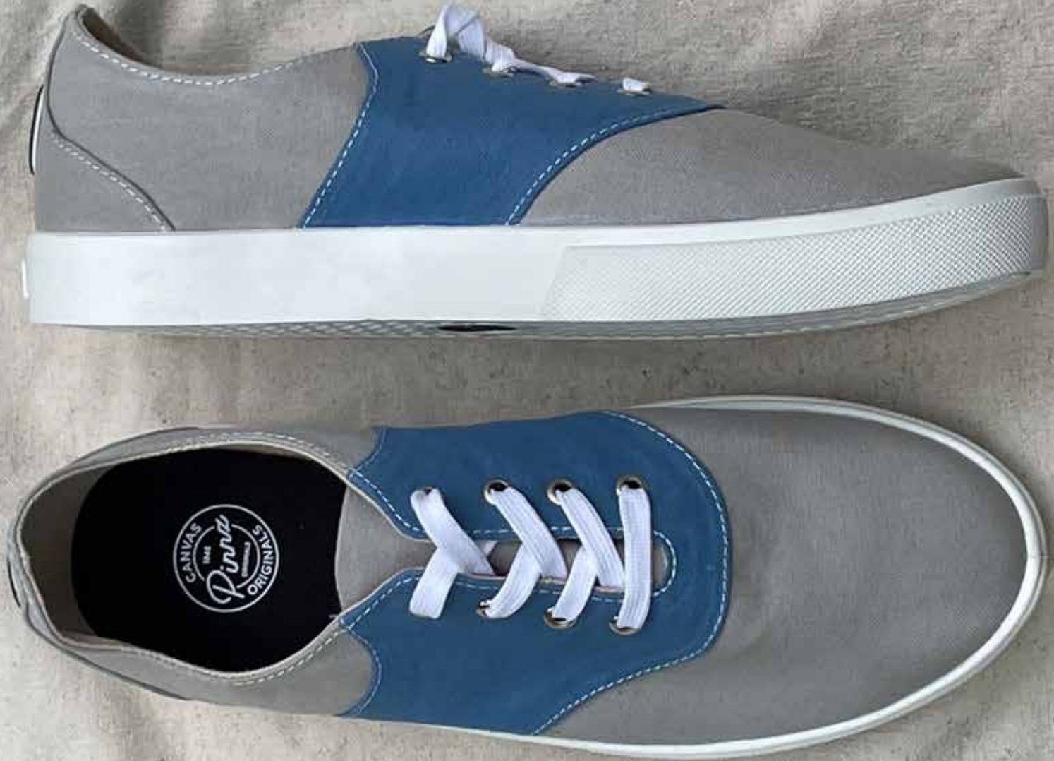
The Saddle Bowler in Yale Blue and Dock Gray