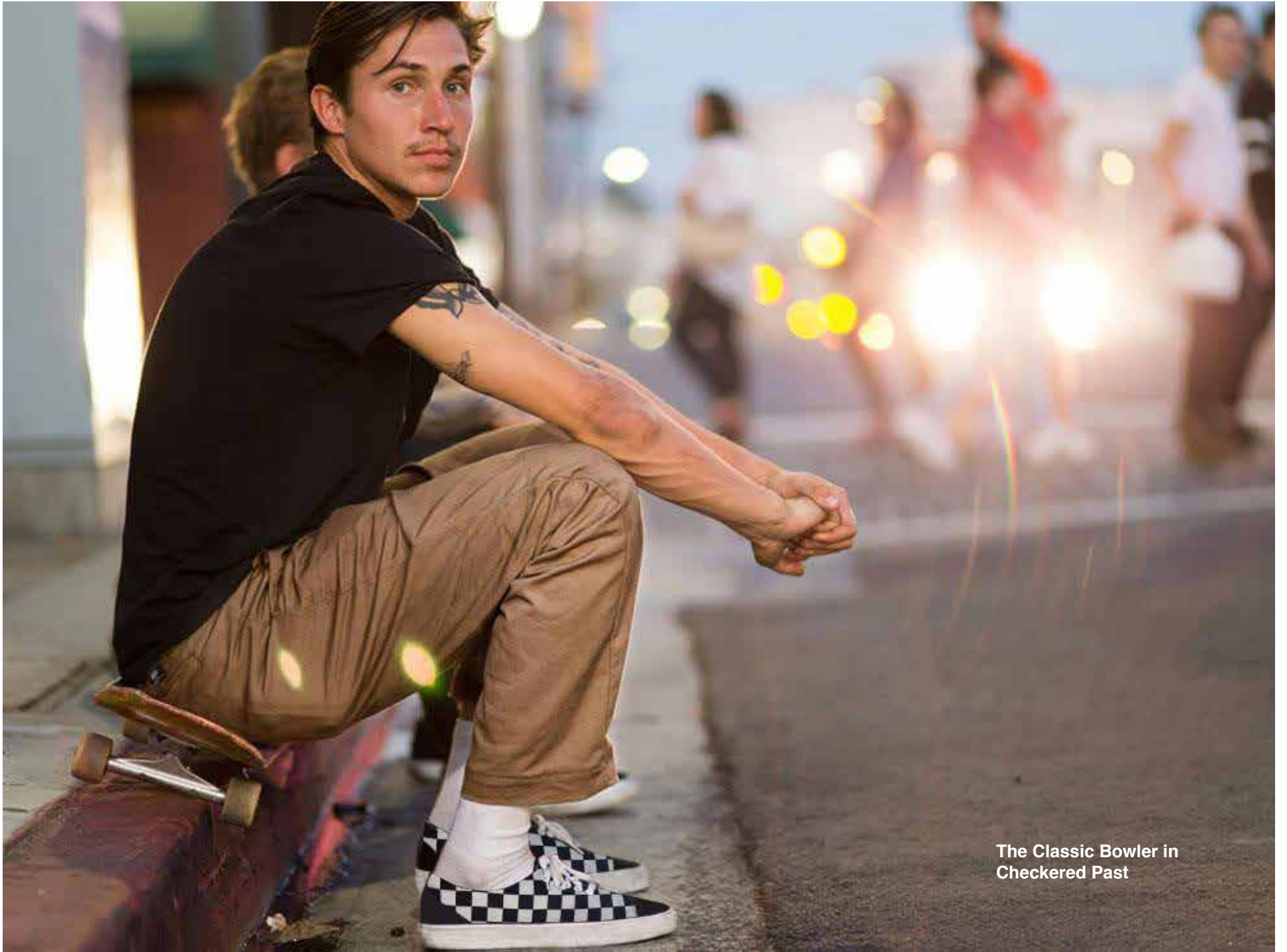
The Classic Bowler in Checked Past