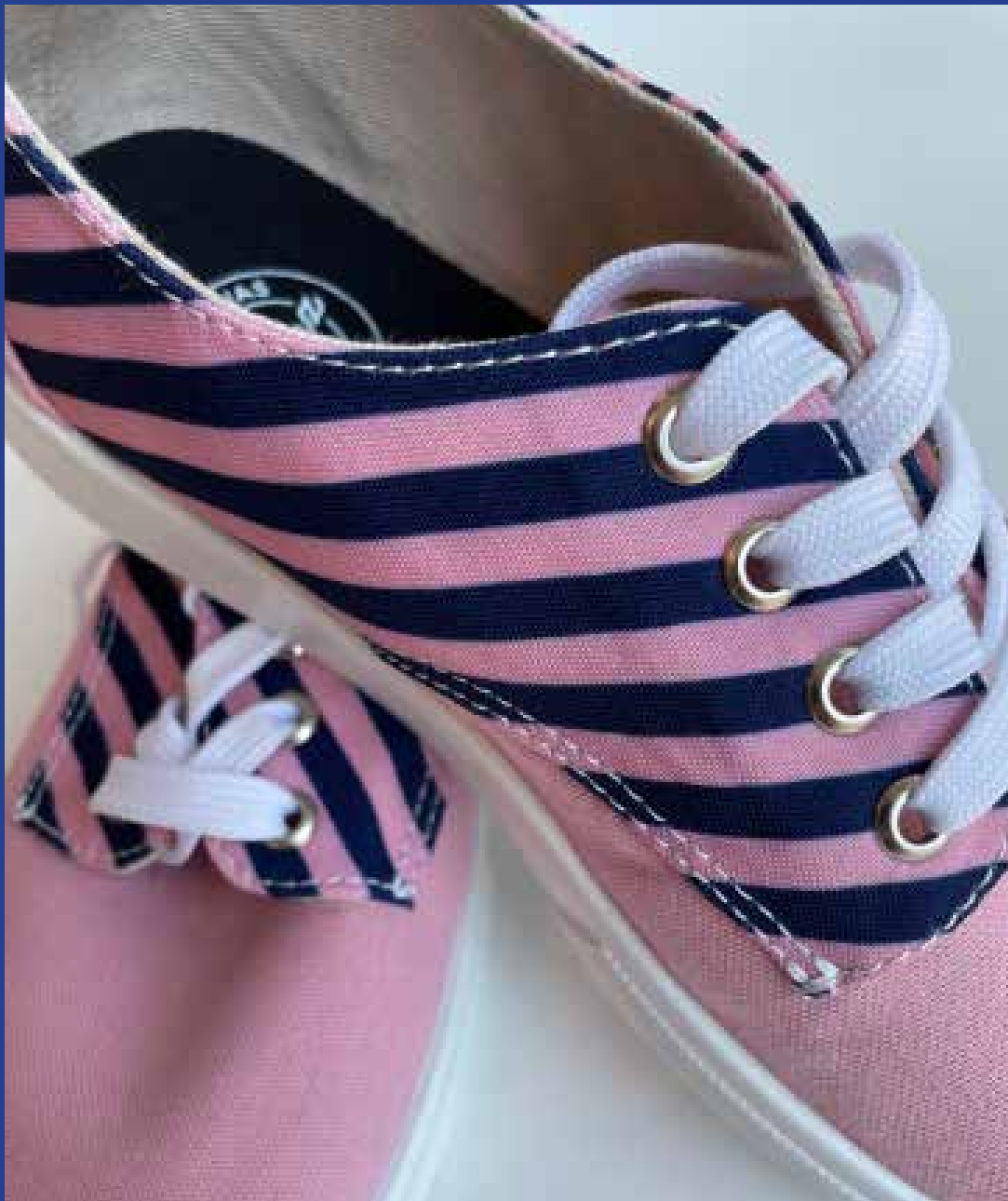
The Buck Bowler in Repp Stripe Navy and Bermuda Sand