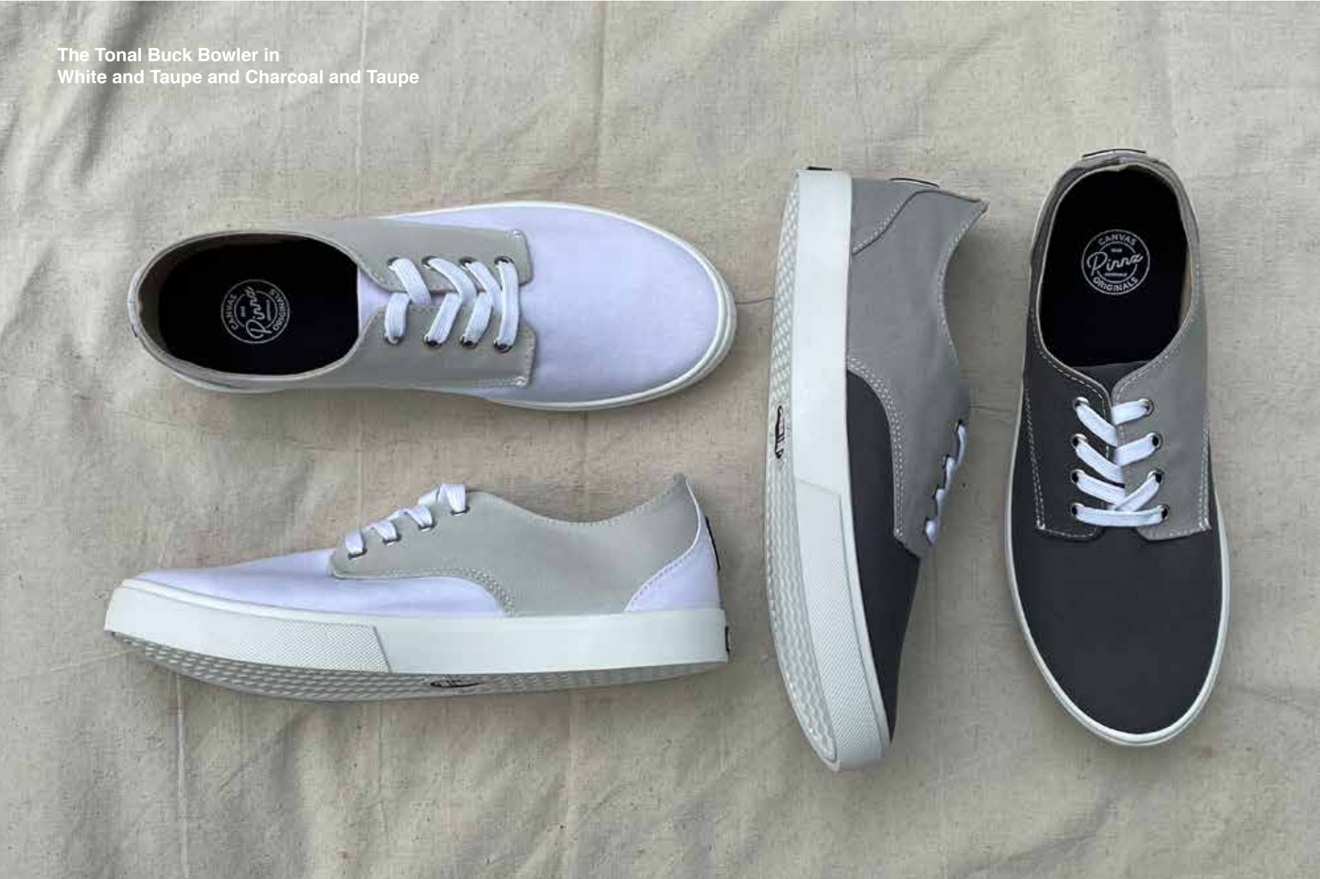
The Tonal Buck Bowler in White and Taupe and Charcoal and Taupe