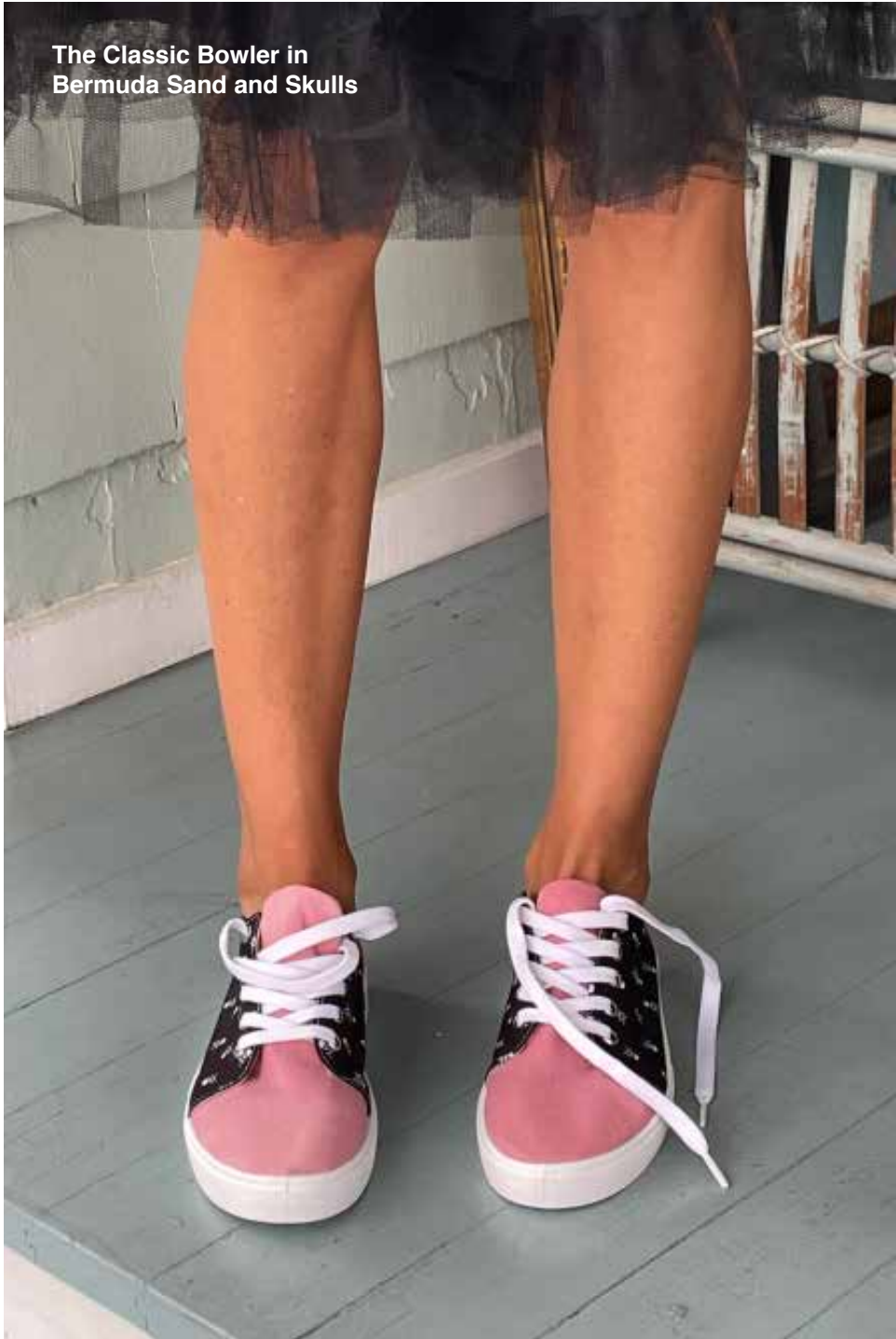
The Classic Bowler in Bermuda Sand and Skulls