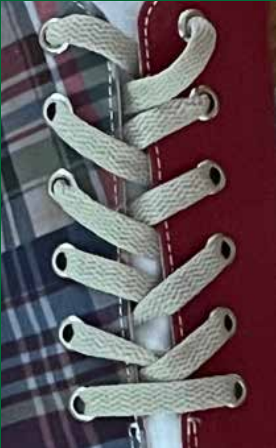
The Retro Bowler in Brick Red and Madras