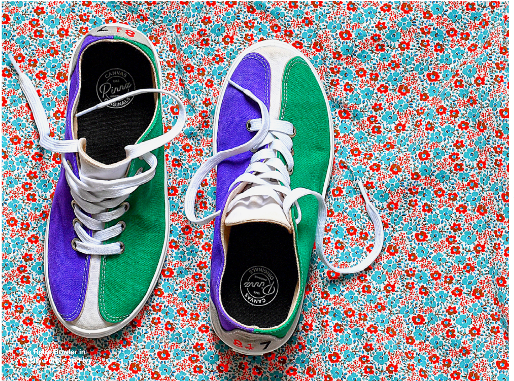
The Retro Bowler in Varsity Purple and Varsity Green