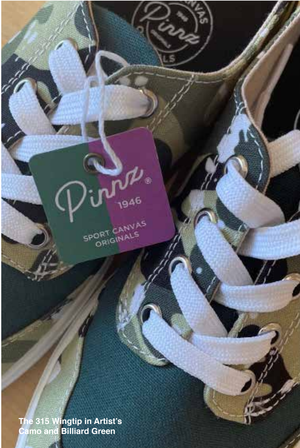
The 315 Wingtip in Artist's Camo and Billiard Green

Introducing Pinnz Sport Canvas Originals: classic shoe styles reimagined as canvas tennis shoes, just for the fun of it. The bowler, the wing tip, the saddle, the buck. (which all have roots in sports, by the way). A preppy/punk style mash up of creativity and irreverence in tried and true models that look good on everyone. Washable canvas that gets better with age. Self expression for you feet.