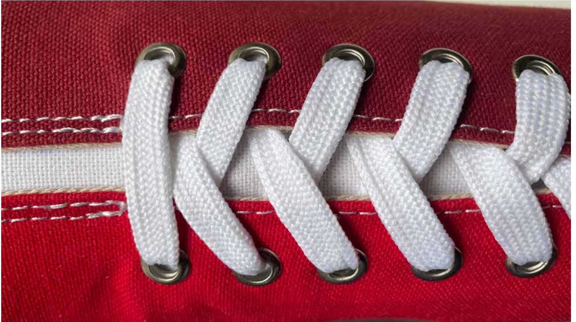
The Two-Tone Retro Bowler in Brick Red and Flag Red