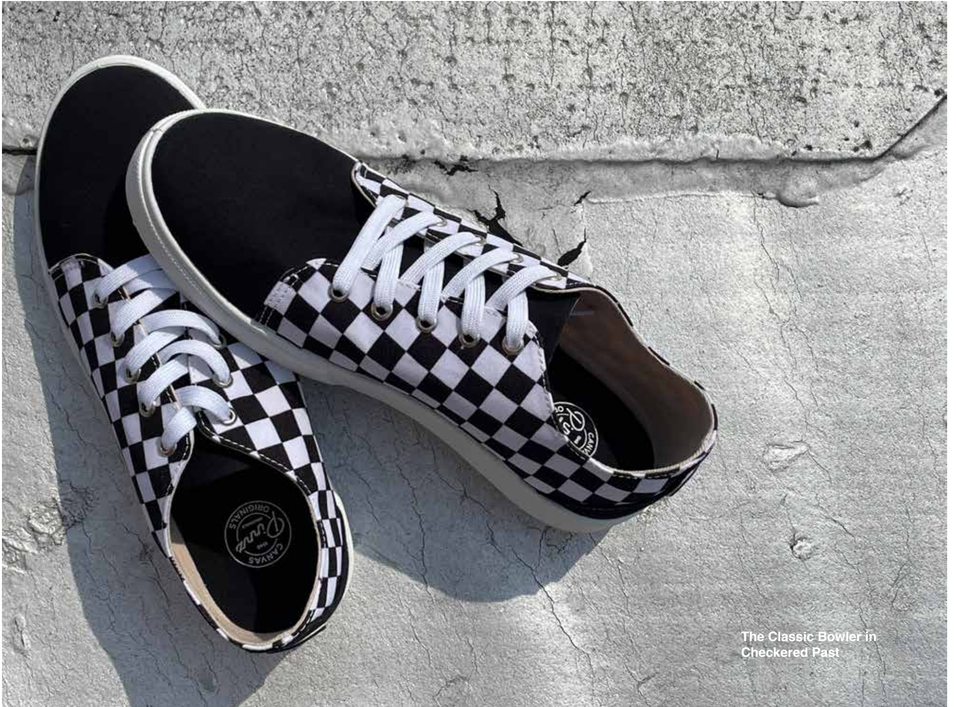
The Classic Bowler in Checked Past