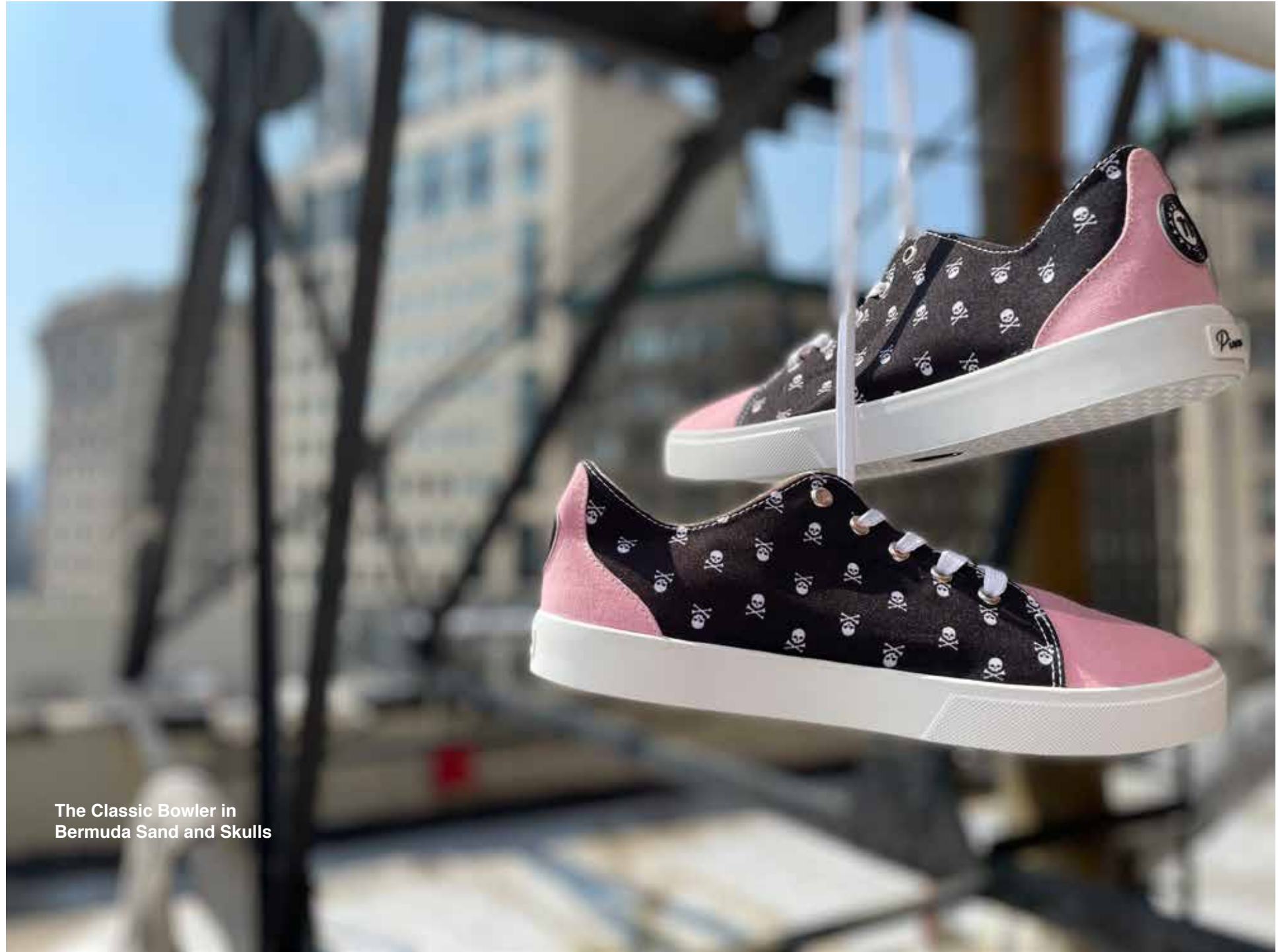
The Classic Bowler in Bermuda Sand and Skulls