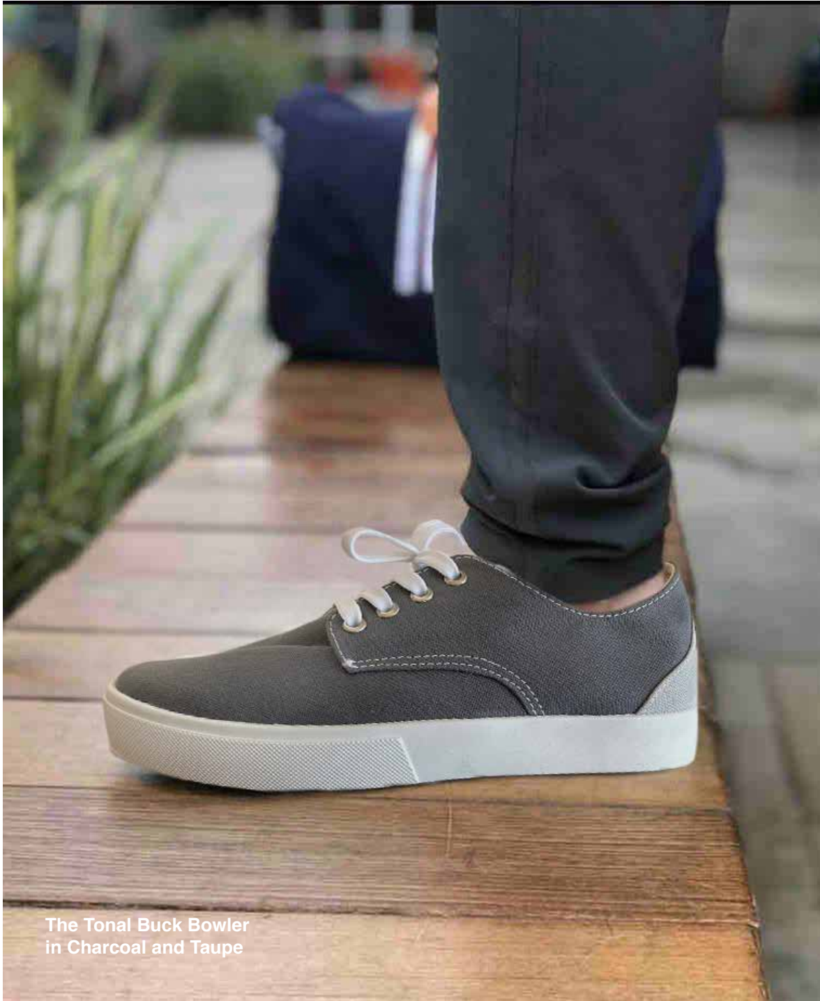
The Tonal Buck Bowler in Charcoal and Taupe