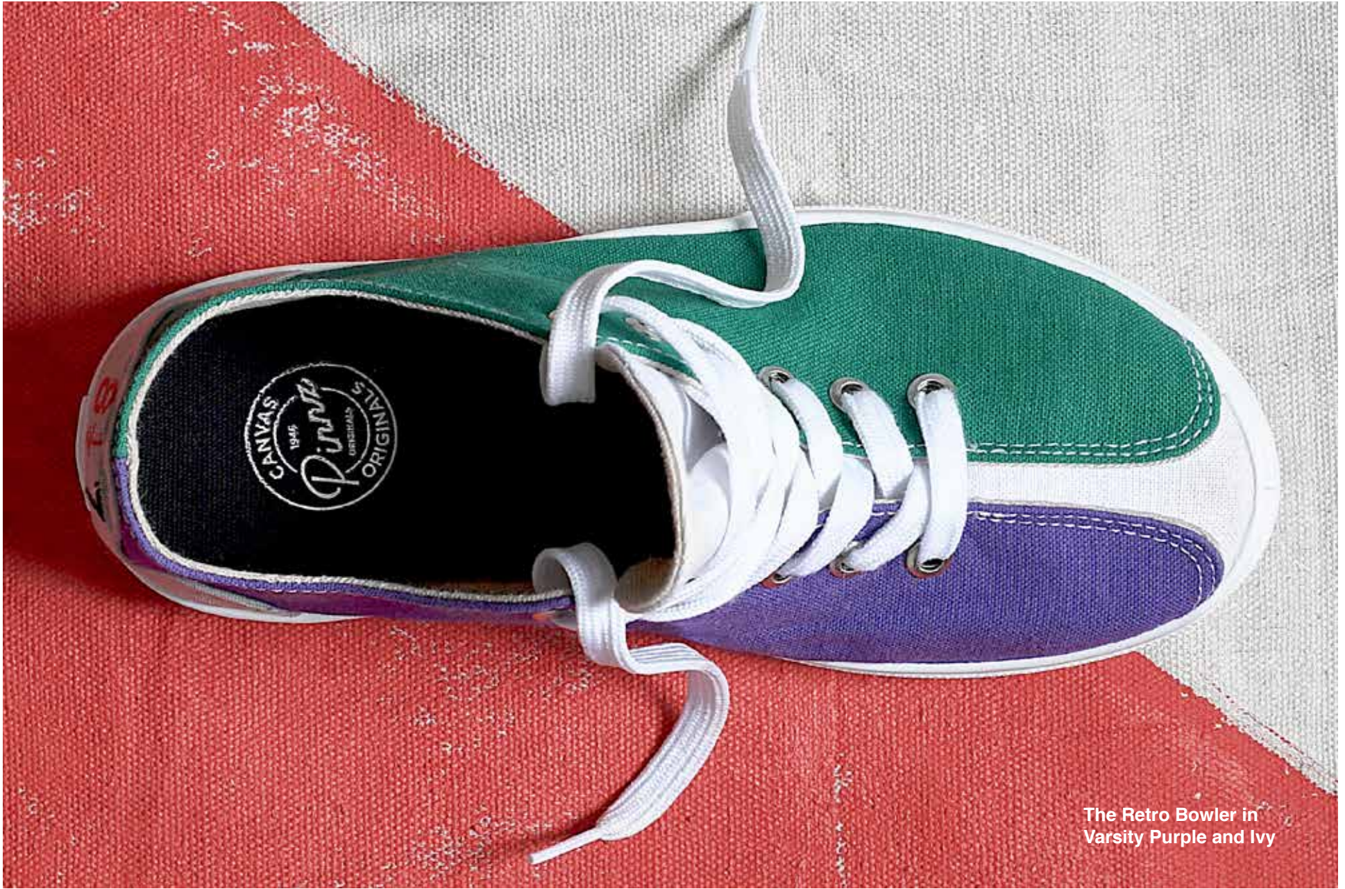
The Retro Bowler in Varsity Purple and Ivy