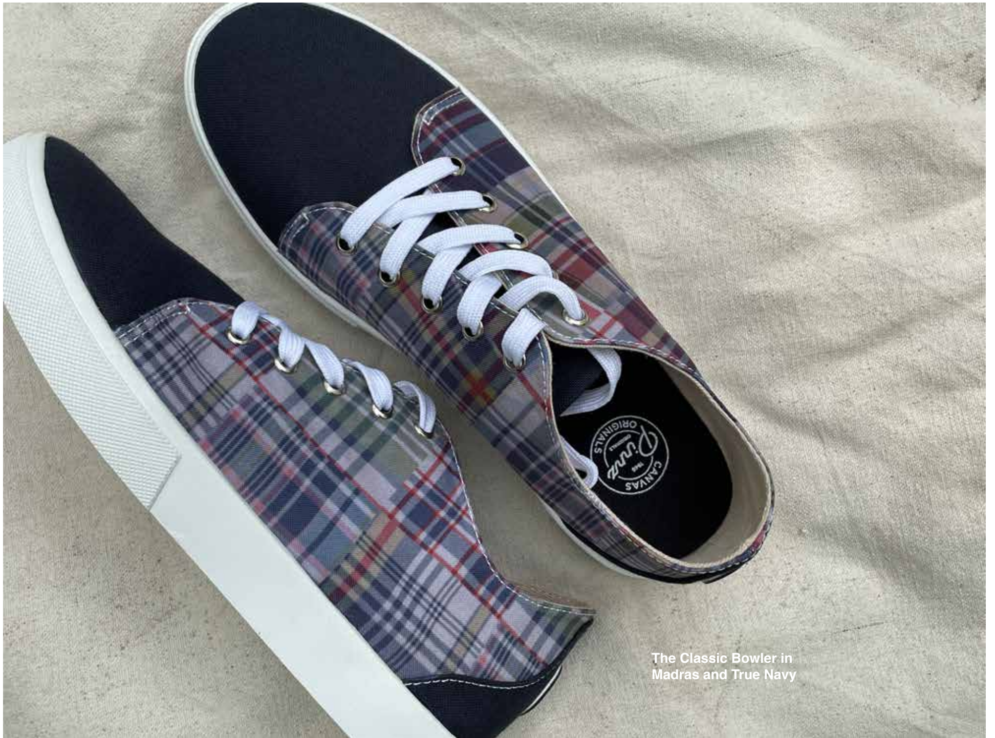
The Classic Bowler in Madras and True Navy